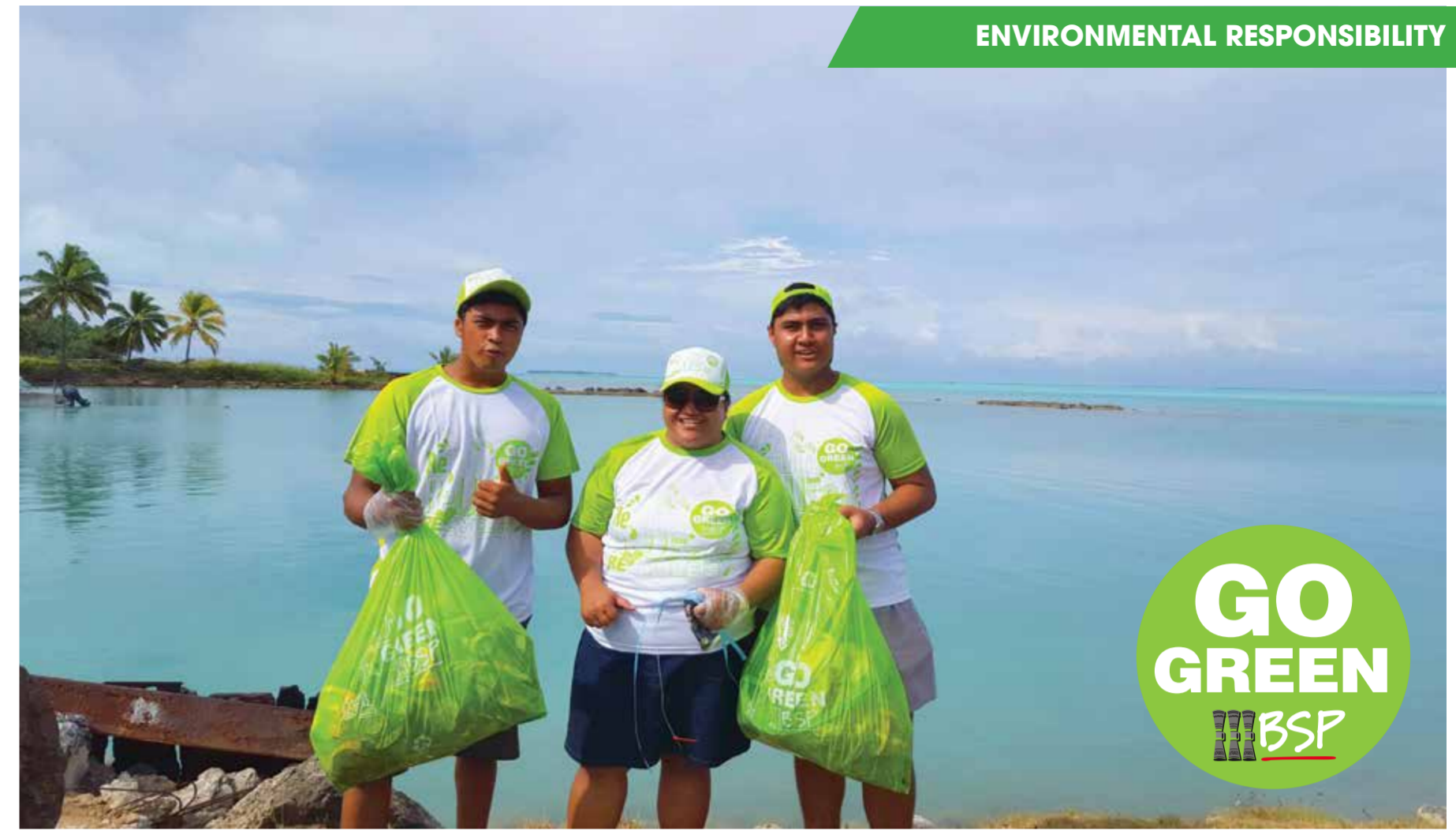
Cook Islanders participating in the Annual School Clean Up Day.