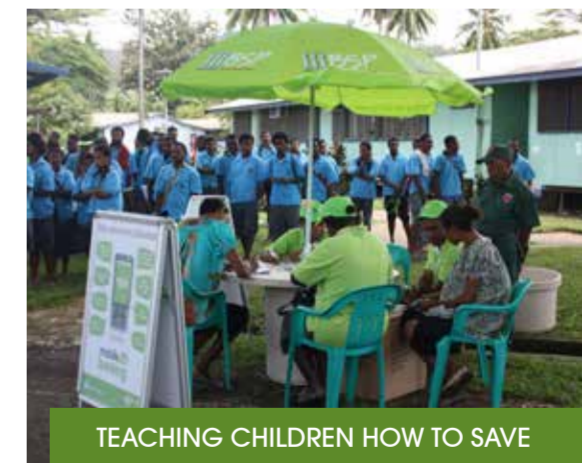
TEACHING CHILDREN HOW TO SAVE