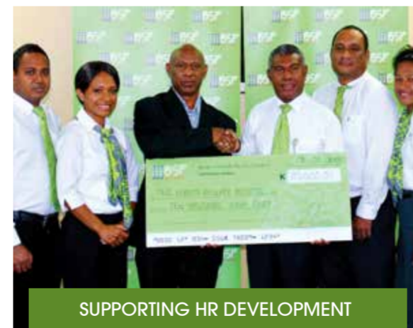
SUPPORTING HR DEVELOPMENT