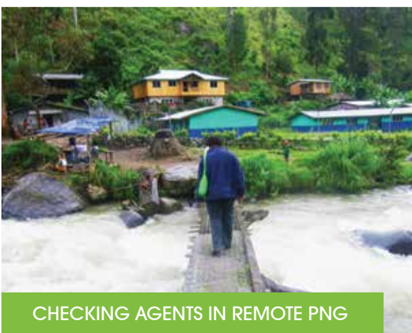
CHECKING AGENTS IN REMOTE PNG

BSP has 291 Agents in communities PNG wide, providing basic banking closer to home.