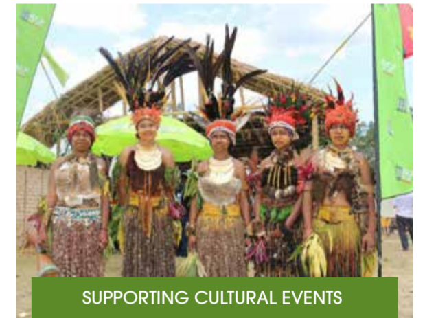
SUPPORTING CULTURAL EVENTS