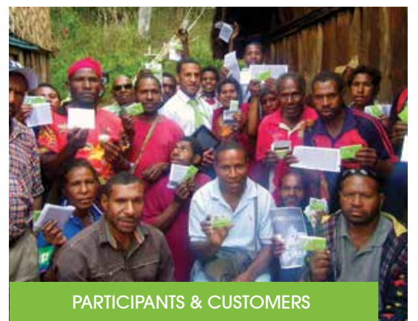
PARTICIPANTS & CUSTOMERS