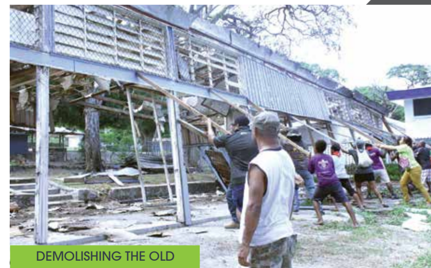
DEMOLISHING THE OLD