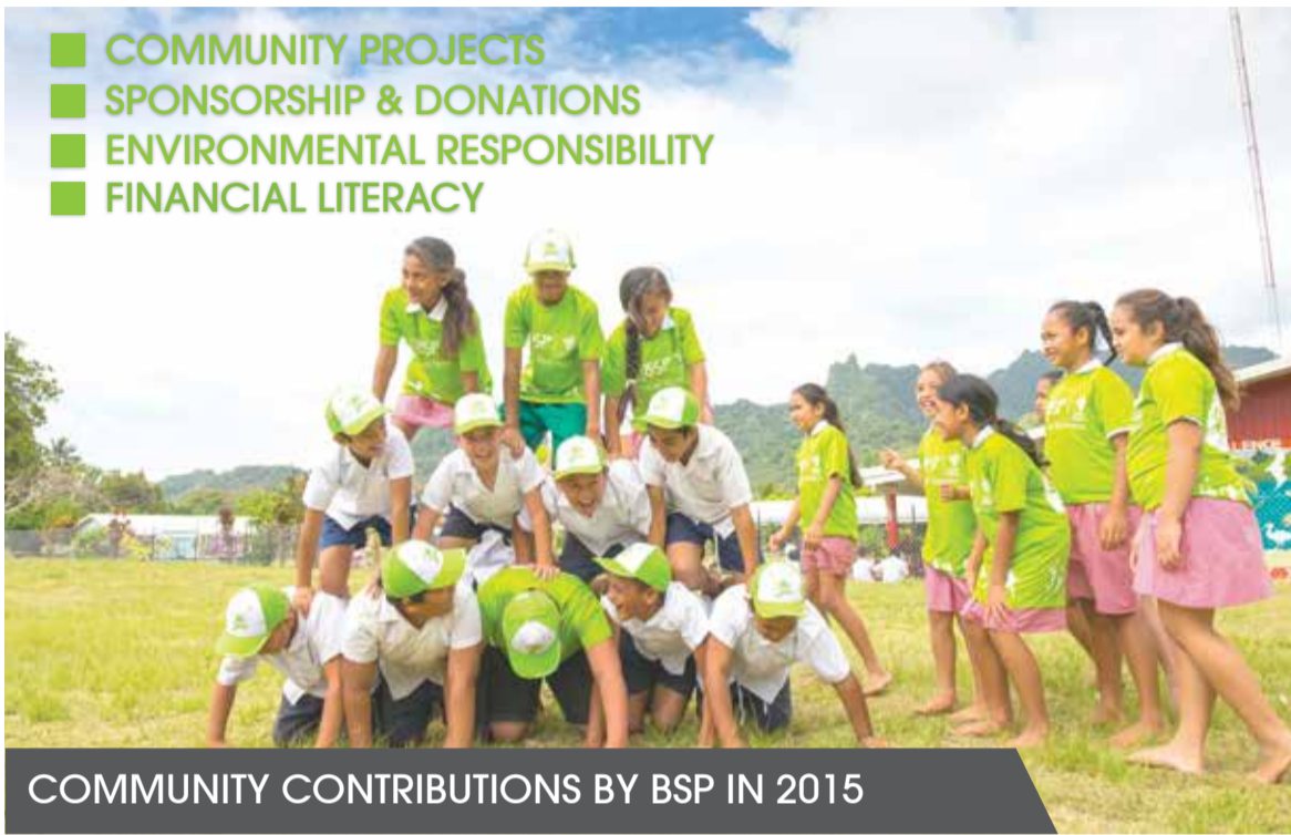
COMMUNITY CONTRIBUTIONS BY BSP IN 2015