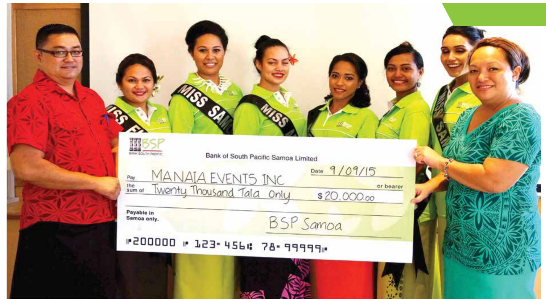
Miss Samoa Pageant.