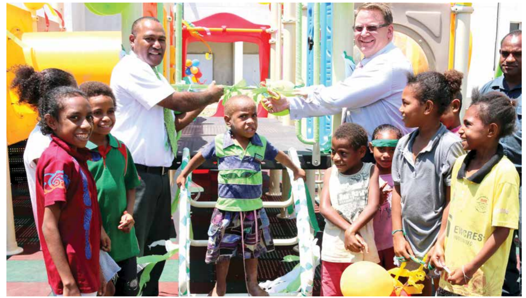
New playground at the Port Moresby General Hospital , built by our two Waigani Branches in Port Moresby. Playing and laughing is good therapy.

Each year we deliver many worthy projects that make a meaningful difference to recipient communities