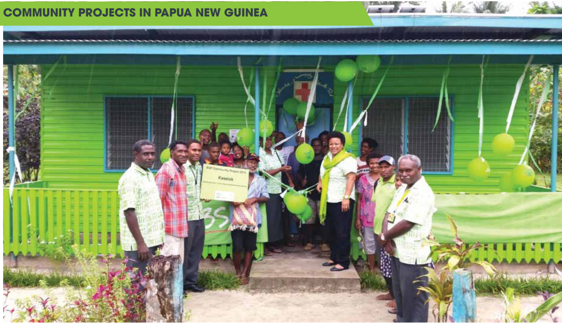
Renovated aidpost in Kavieng, New Ireland Province.