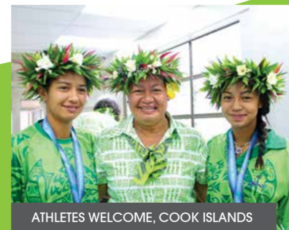
ATHLETES WELCOME, COOK ISLANDS

Quick fact: BSP acquired Westpac Operations in SI, Cook Islands, Samoa and Tonga in July 2015.