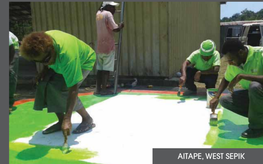
AITAPE, WEST SEPIK