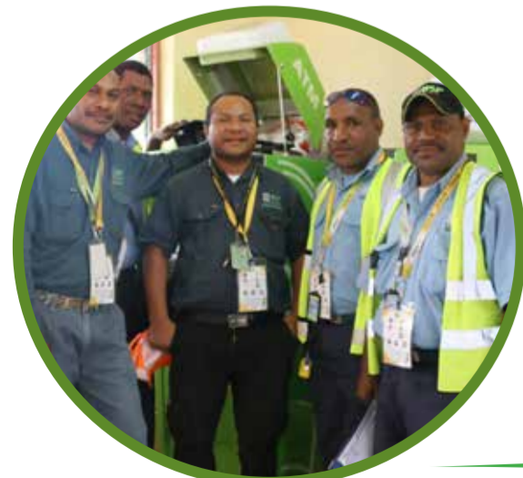
BSP WANTOK VOLUNTEERS