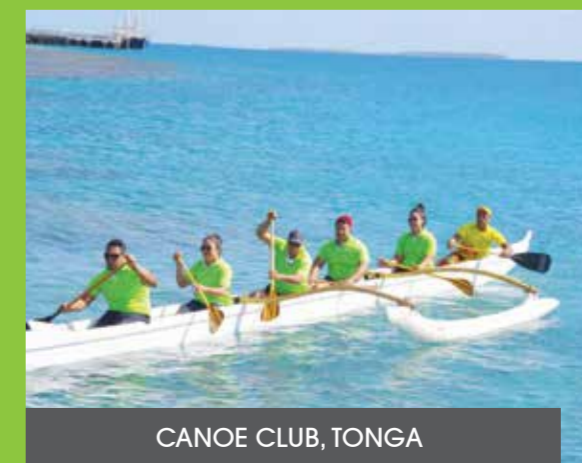
CANOE CLUB, TONGA