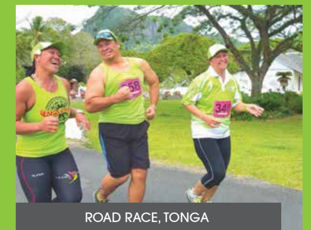
ROAD RACE, TONGA