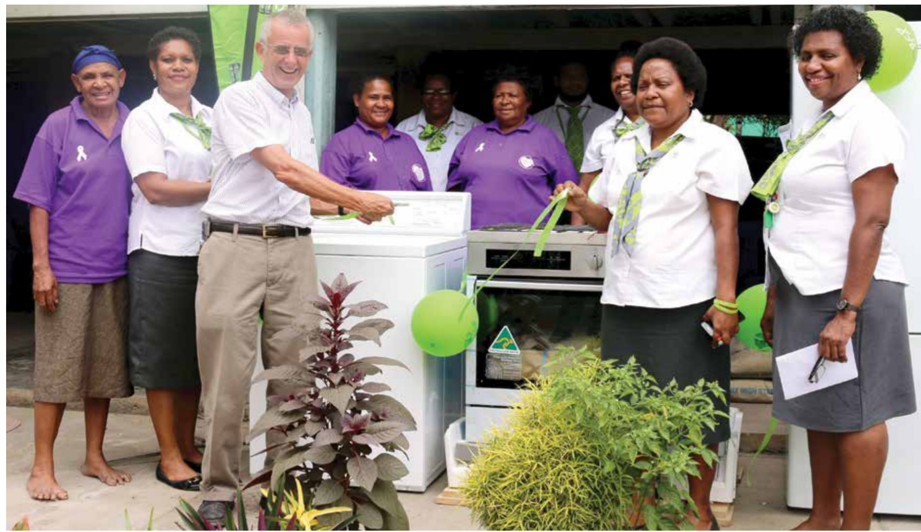
Helping shelter women in need. Our Boroko and Port Moresby Branches helped the City Mission.