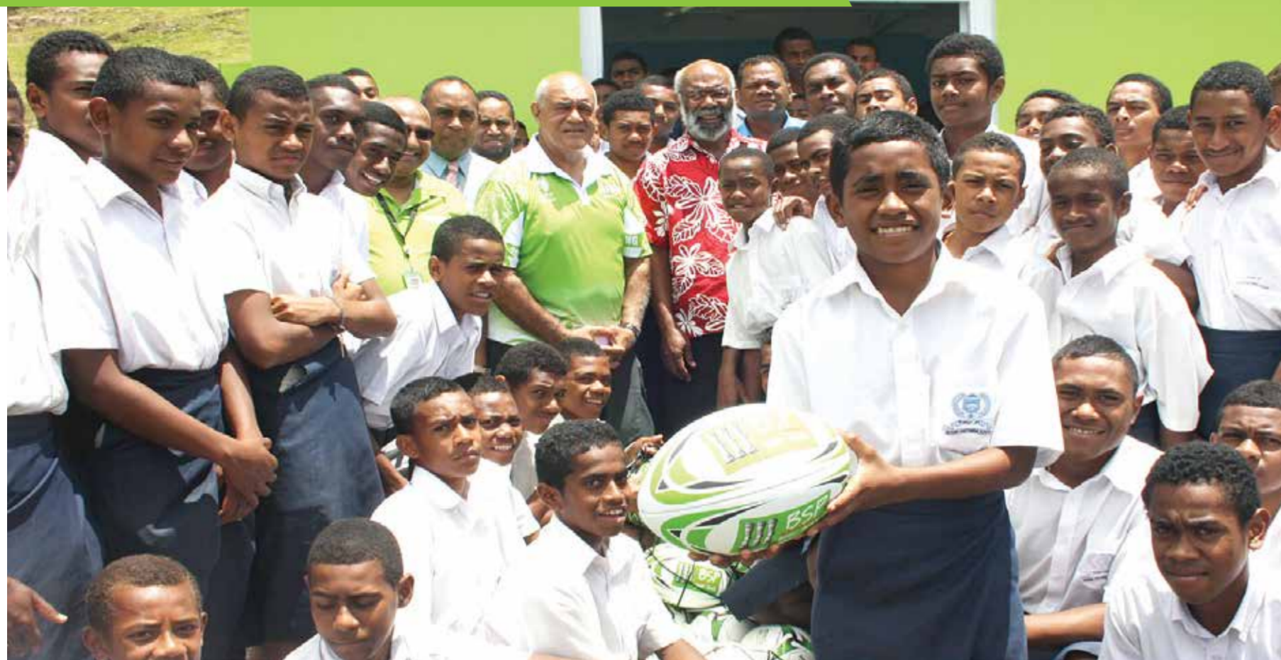
Queen Victoria School Gym.