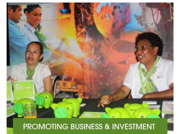
PROMOTING BUSINESS & INVESTMENT