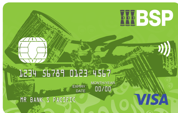
BSP Classic VISA Debit Card*

Move through shopping queues quicker by touching your card to the payment device without the hassle of entering a PIN.